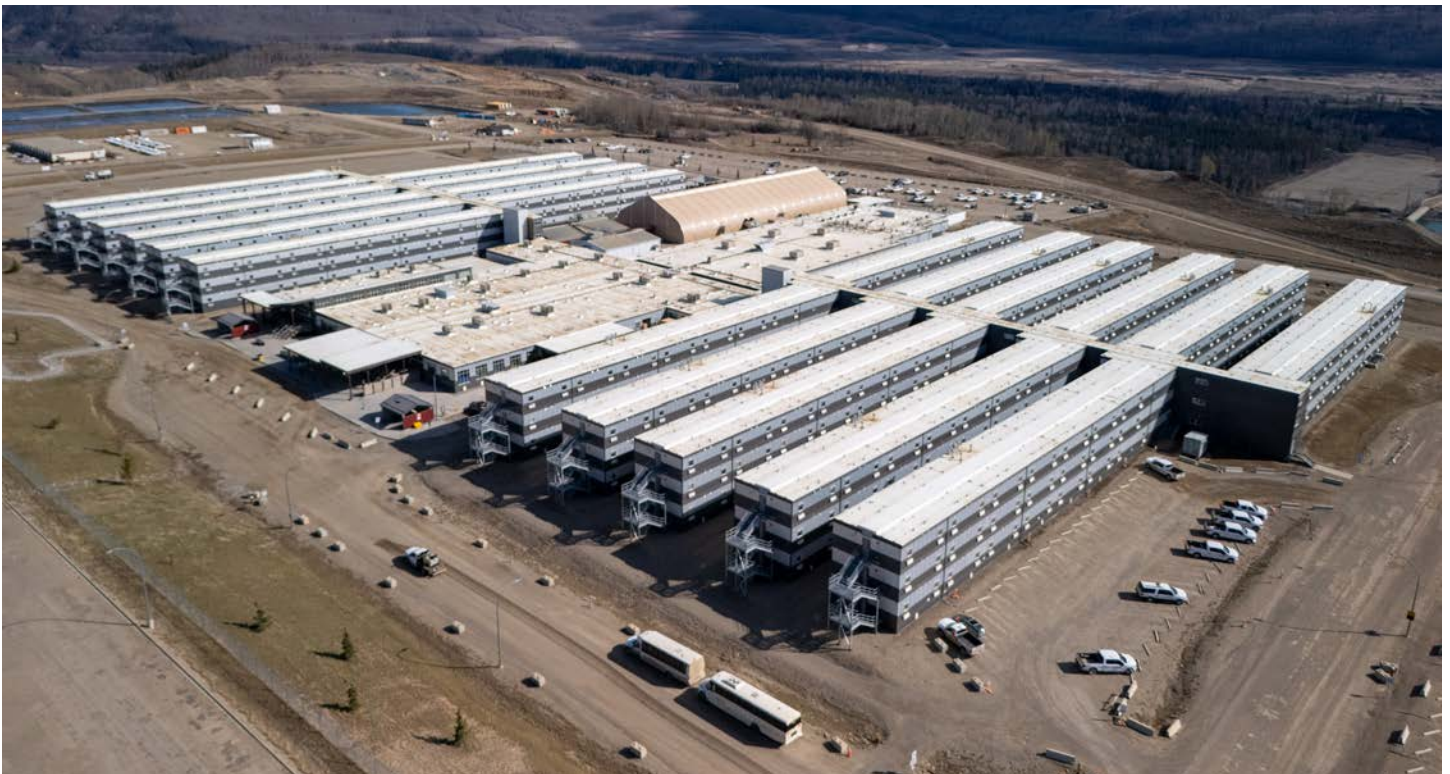
Site C camp

BC Hydro and its contractor are also working on a decommissioning plan to ensure the proper removal of the facility if no one acquires it. The plan includes identifying and salvaging materials for recycling or reuse.