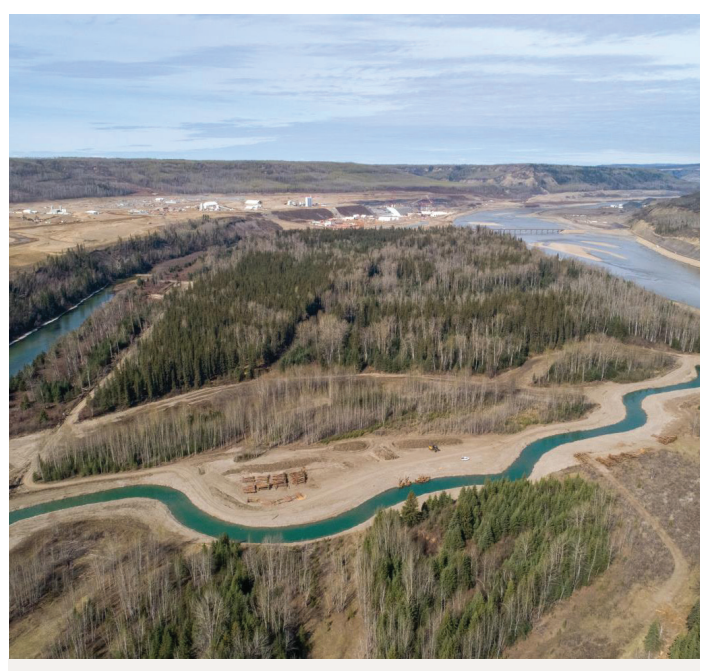
Newly-built channels provide fish habitat enhancements