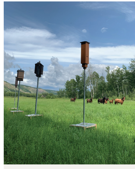
Newly-installed bat habitat

We'll evaluate our mitigations throughout diversion and may adjust the program over time.