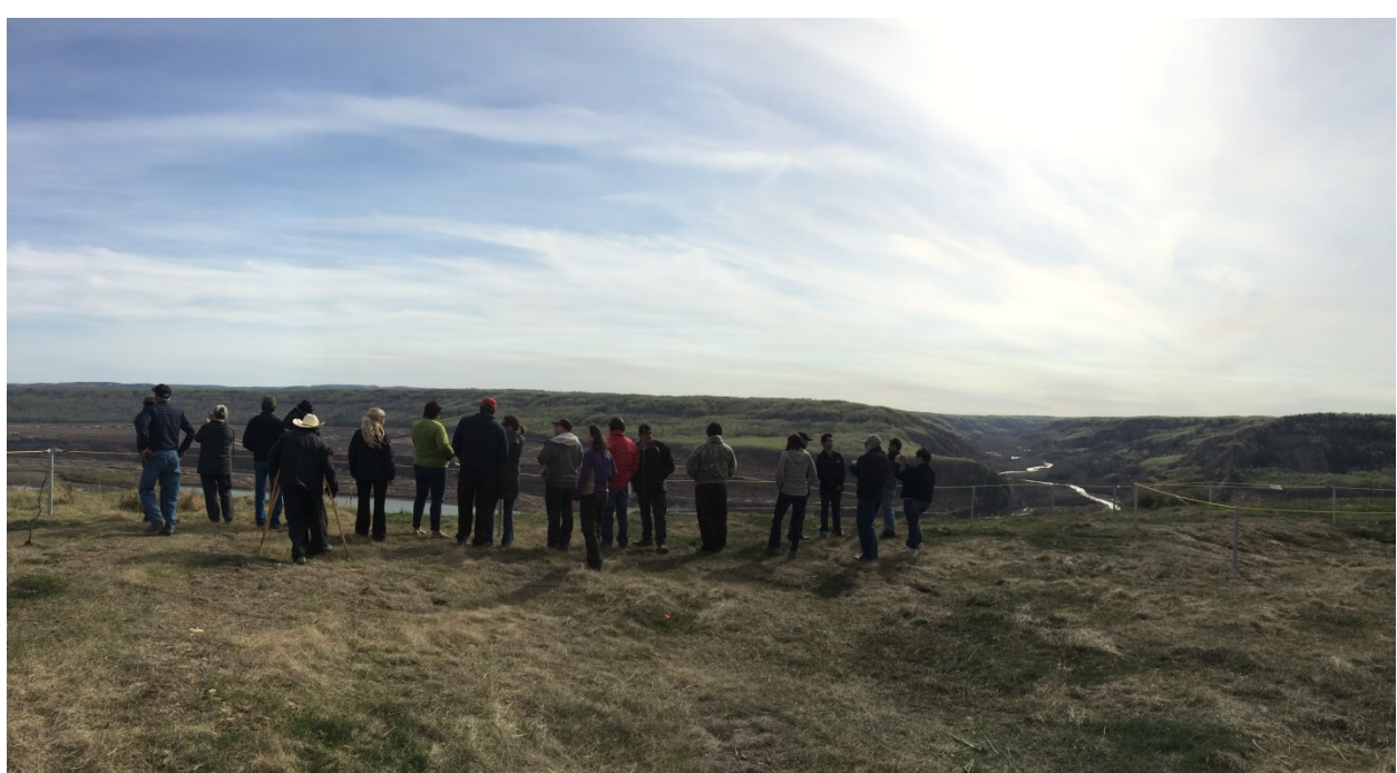
Photo 2. Culture and Heritage Resources Committee at Site C north bank viewpoint

attended by BC Hydro and representatives from Doig River First Nation, Halfway River First Nation, McLeod Lake Indian Band, Dene Tha' First Nation, Duncan's First Nation, Horse Lake First Nation, Métis Nation BC, and Kelly Lake Métis Settlement Society.