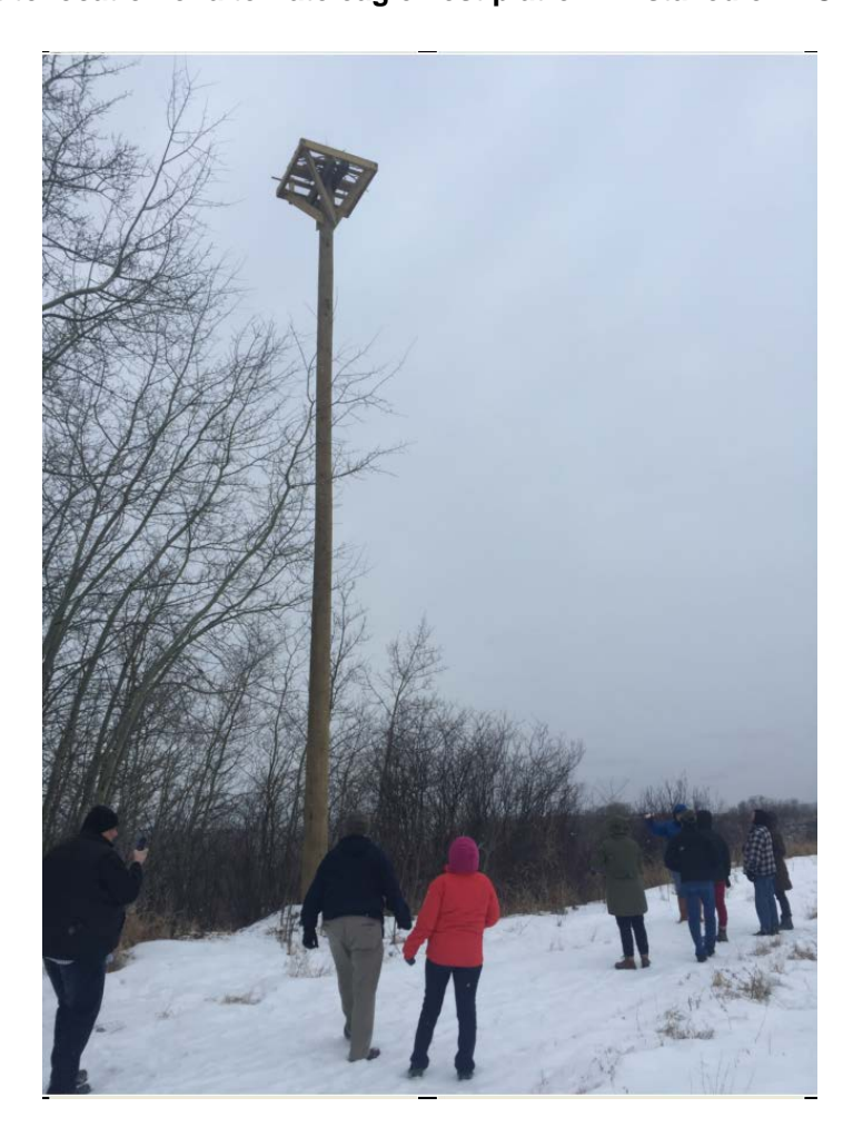
Photo 1. Site visit to location of alternate eagle nest platform installed on BC Hydro property.

• On April 20, 2016 , the Committee participated in an all-day site visit which included a boat tour to Rocky Mountain Fort to observe the heritage investigations occurring at the site, as well as a visit to the Site C north bank viewpoint. The Committee meeting was