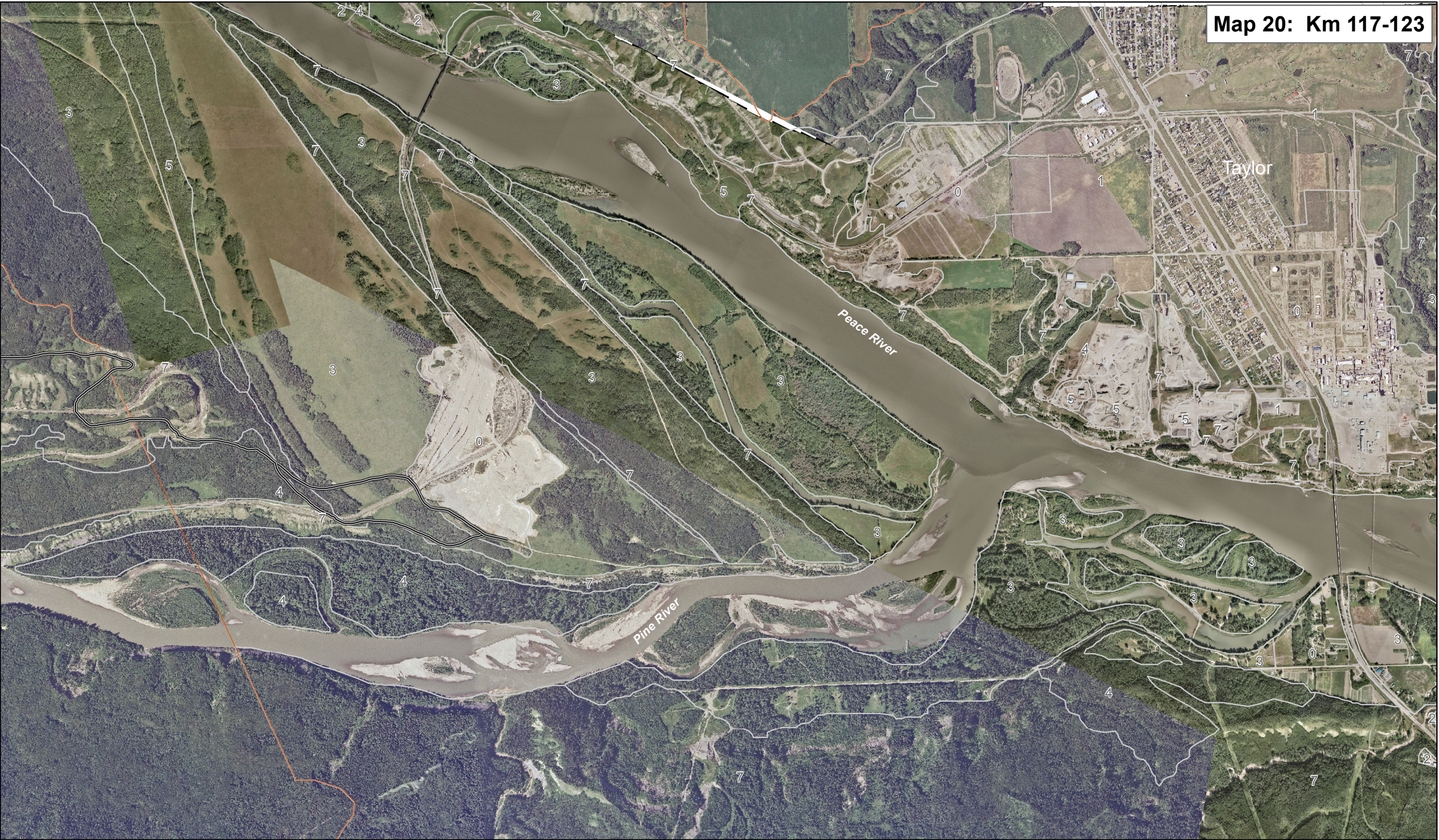
Map 20: Km 117-123