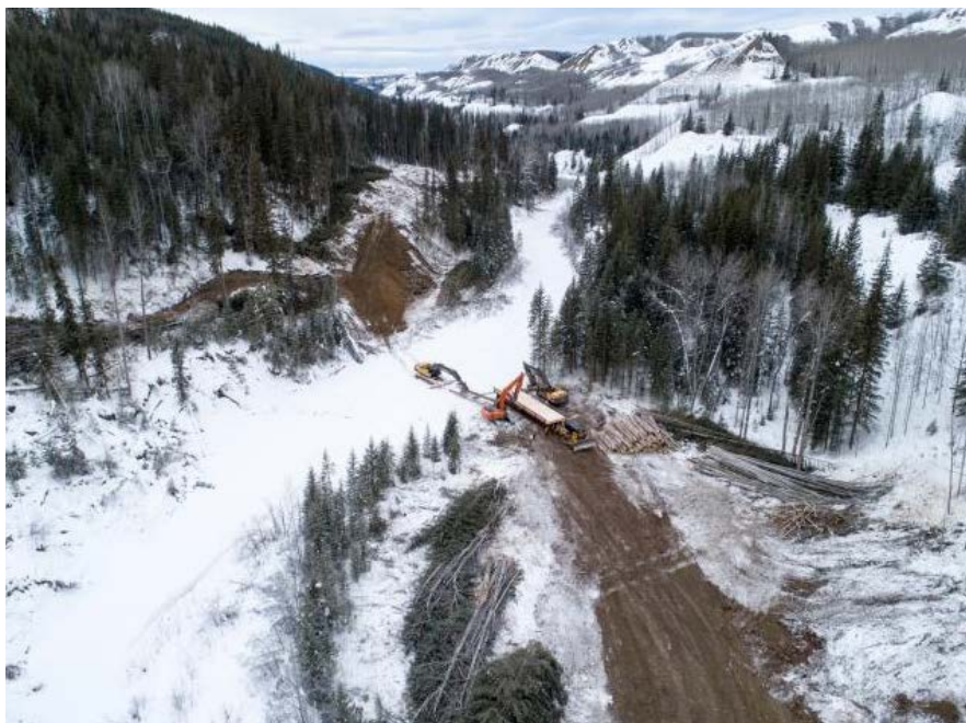
Photo: Reservoir clearing in the Cache Creek drainage area

During spring and summer 2019, clearing will be limited to avoid bird-nesting season and reduce other impacts on the environment.